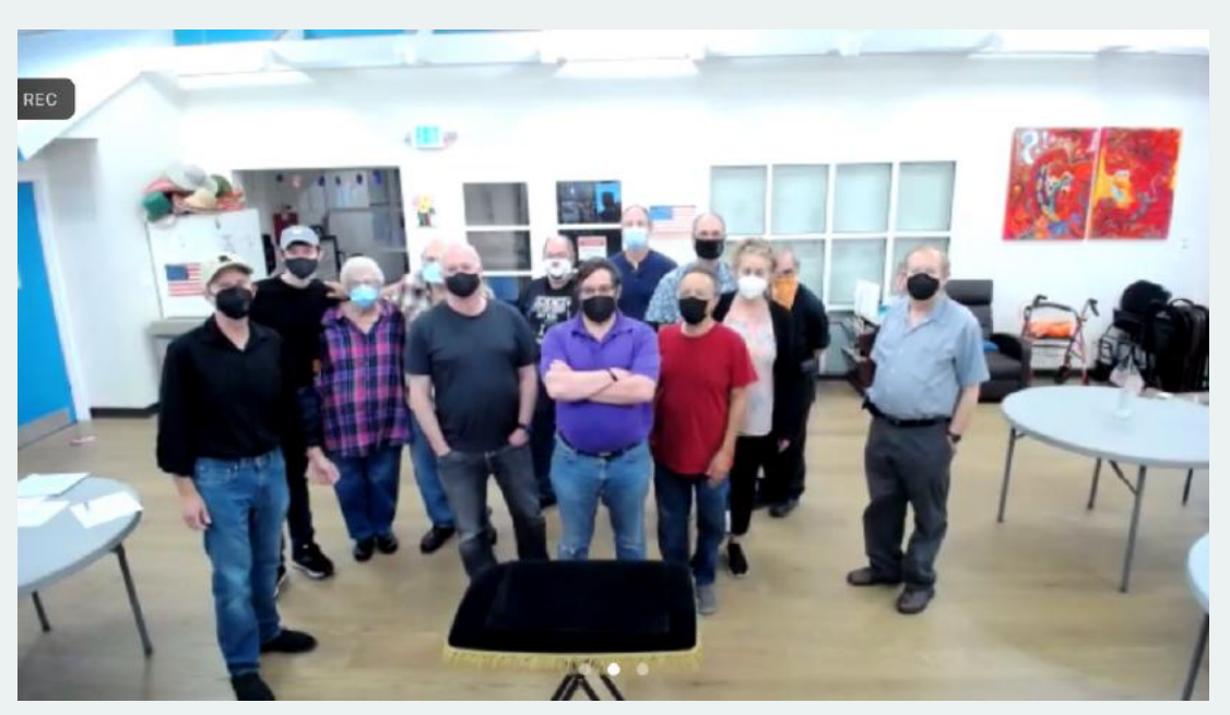
Members come together to say "hi" to everyone on Zoom!